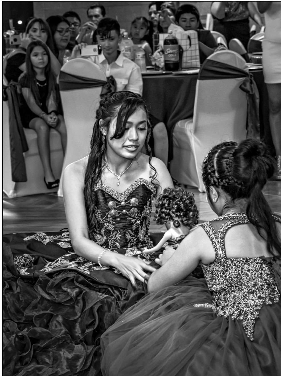
The Last Doll