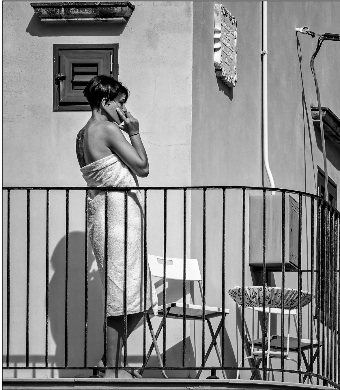
The Phone Call