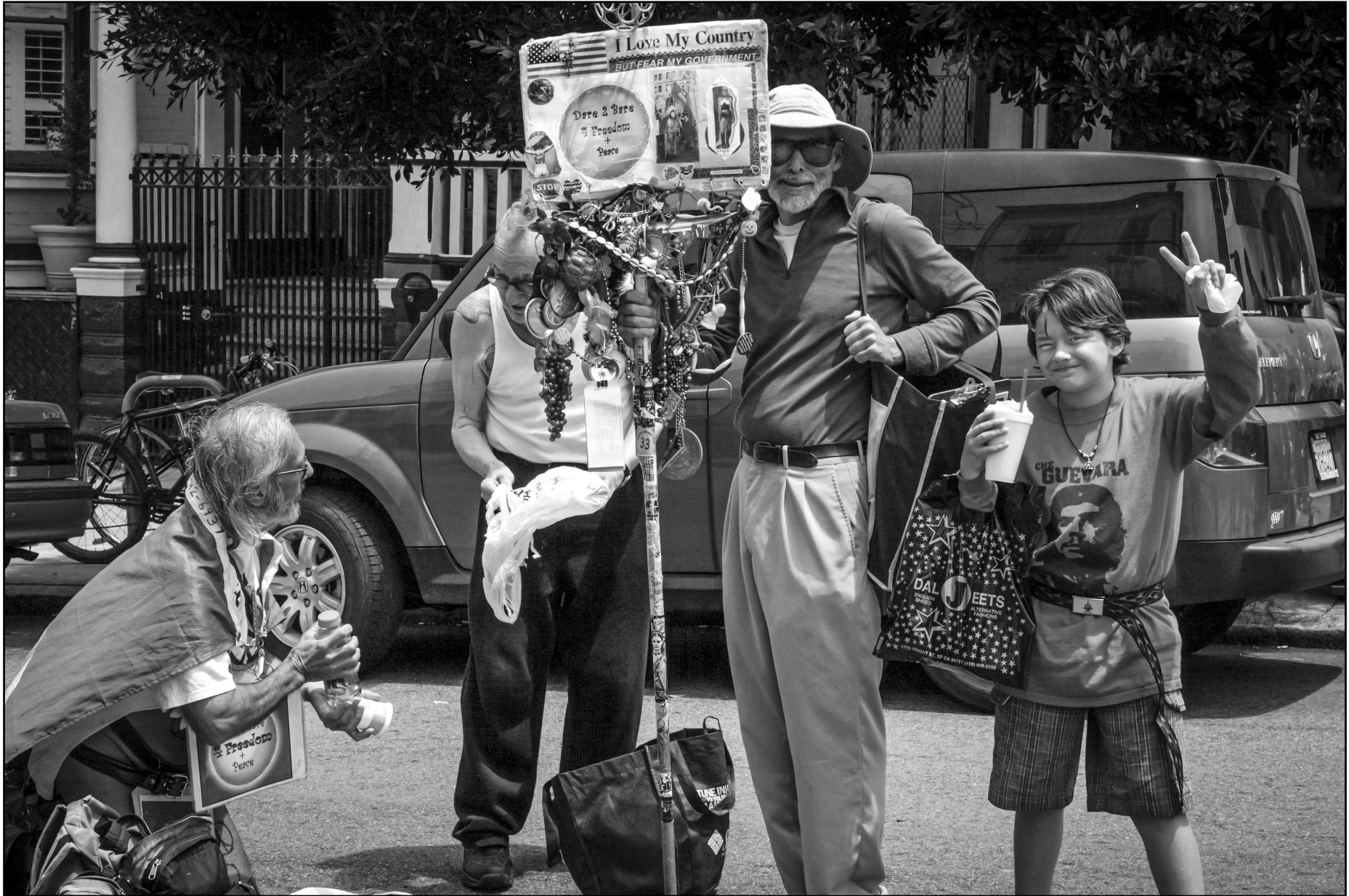
I Love My Country