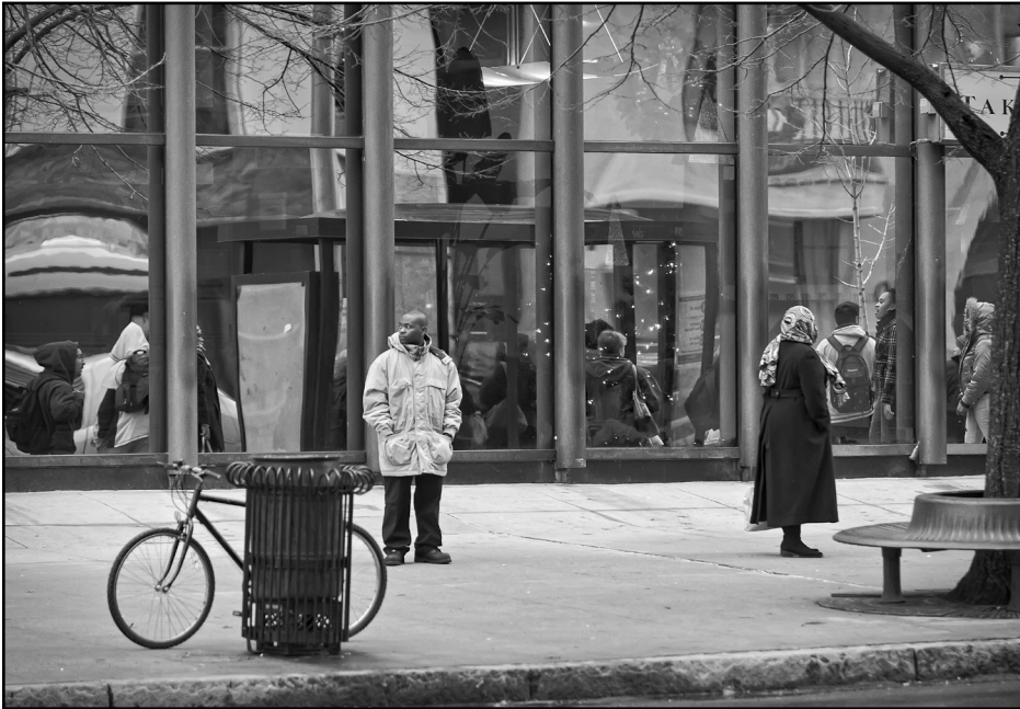
On The Go