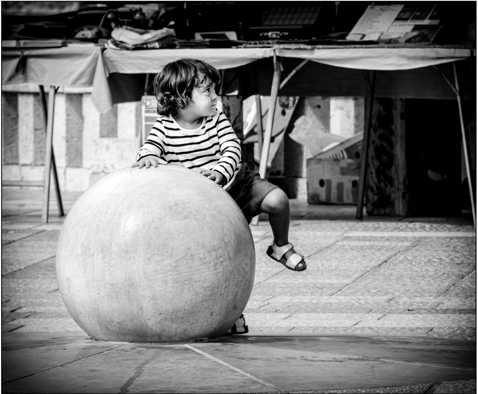
Having A Ball