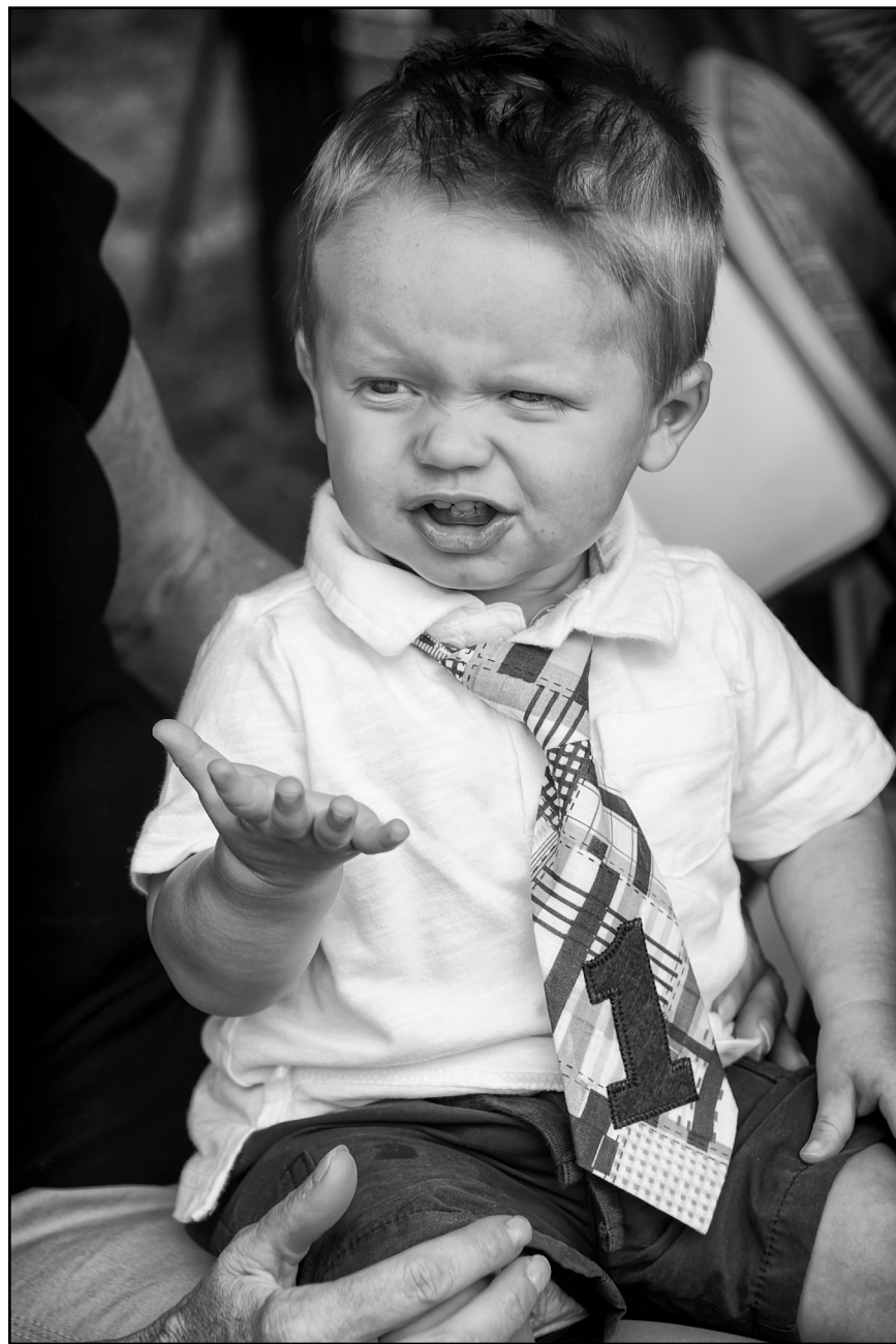
You Talkin' To Me?