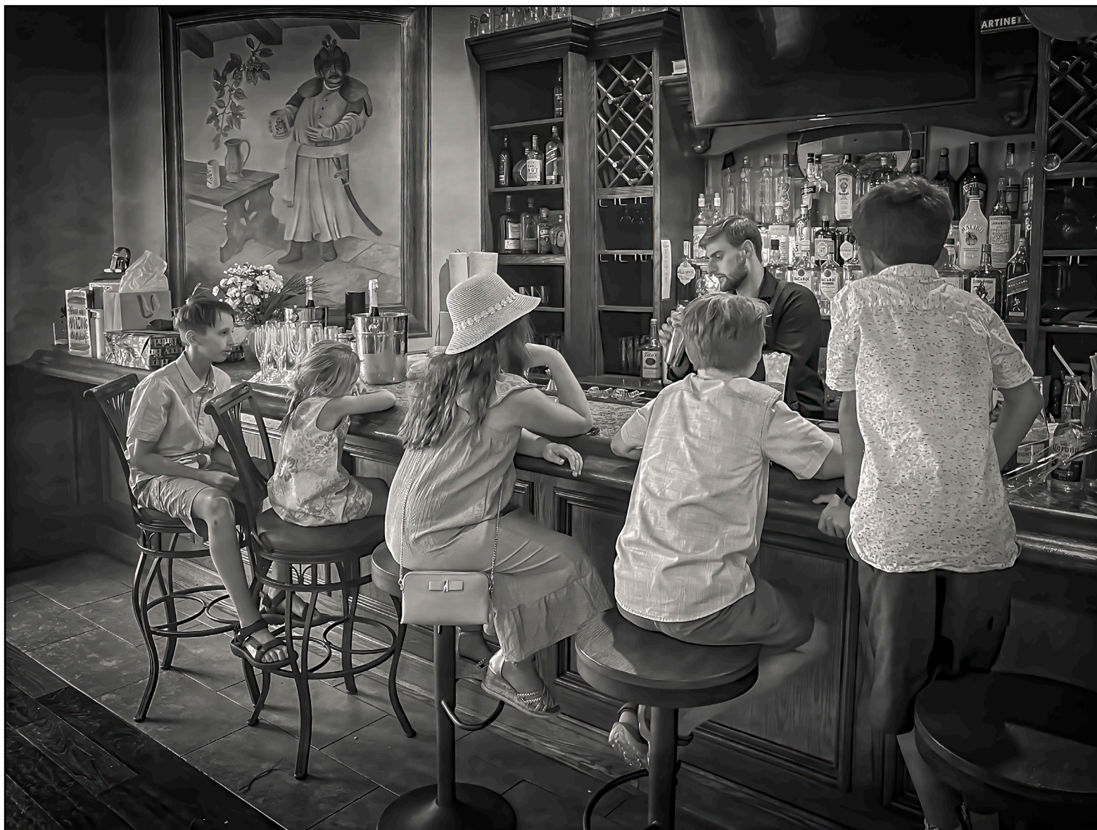
Taking It All In