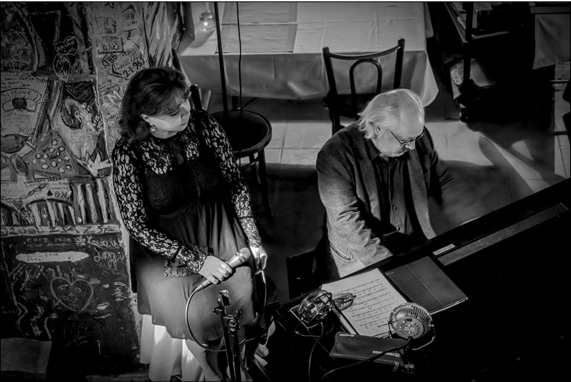
Heart And Soul