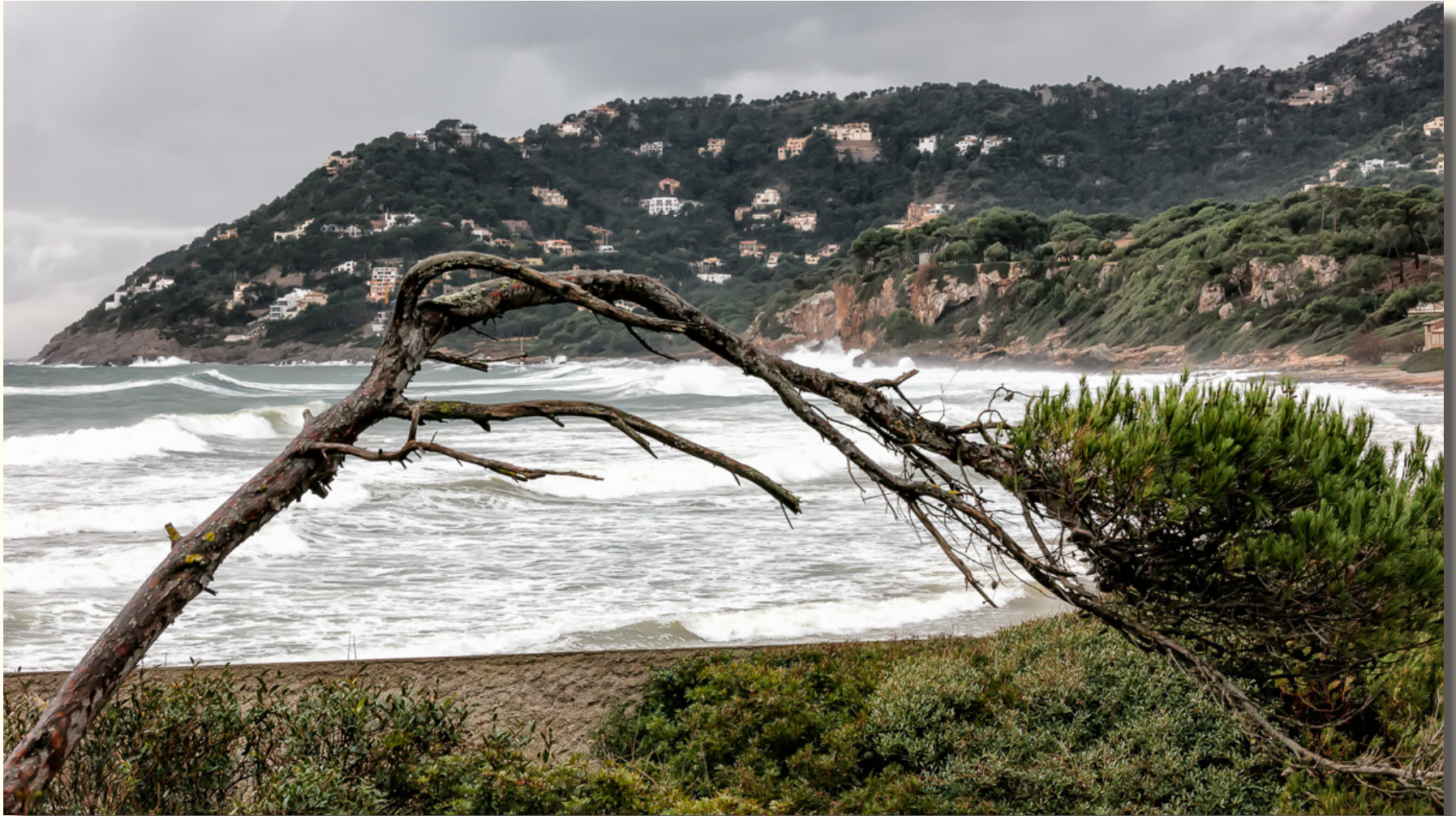
This one is from Cala Canyamel.