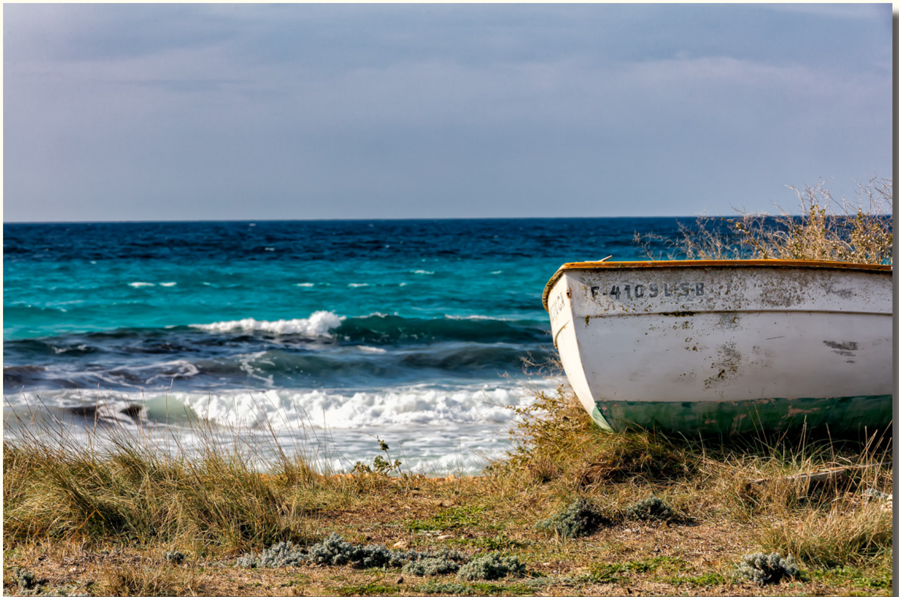
These next two were from the area near a town called Colonia Sant Jordi.