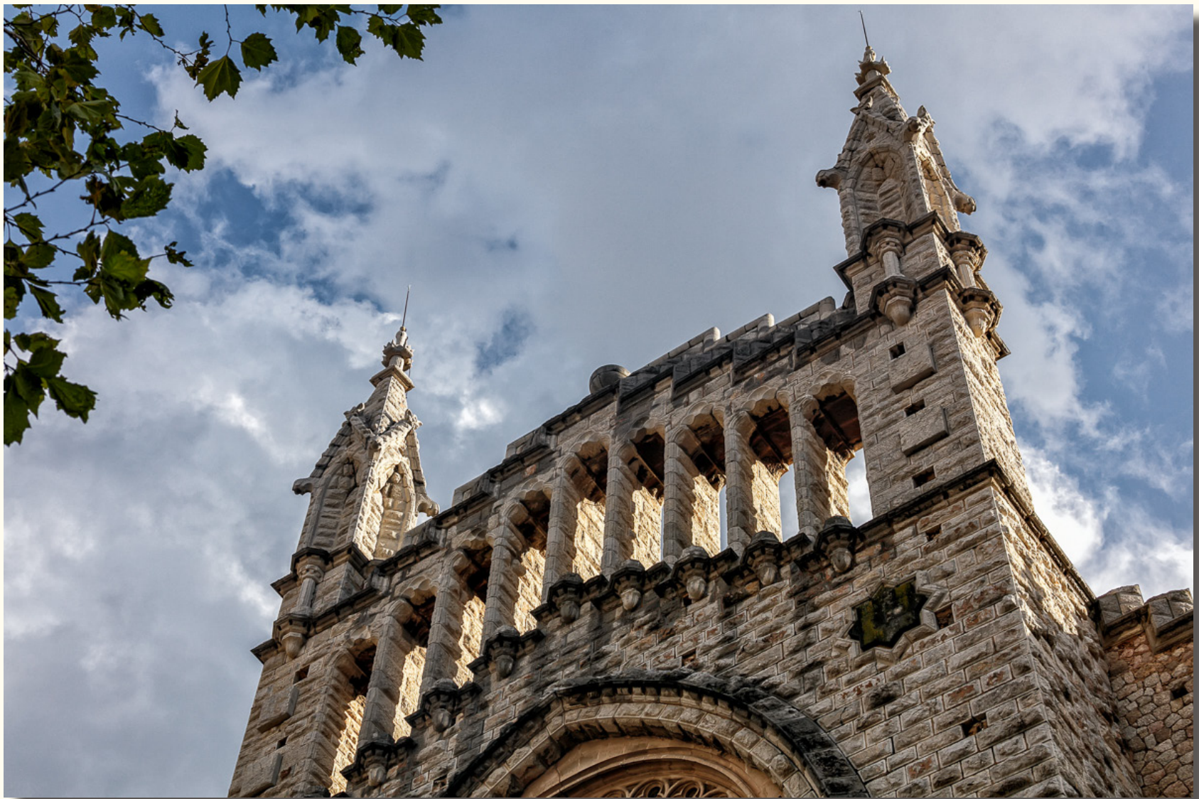
The 1912 church of Sant Bartomeu (Saint Bartholomew) in the town of Sóller is the dominant highlight.