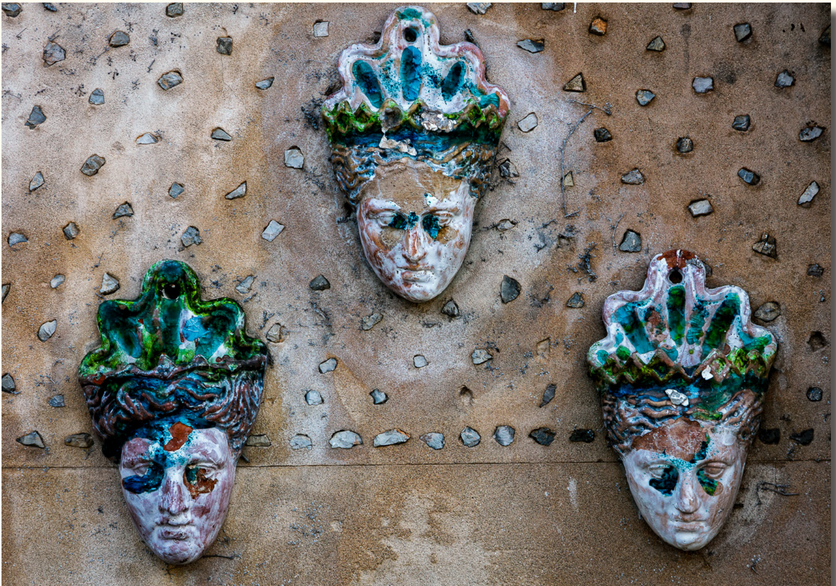
The pretty village of Valldemossa has many unique shops which make it a delight to visit.