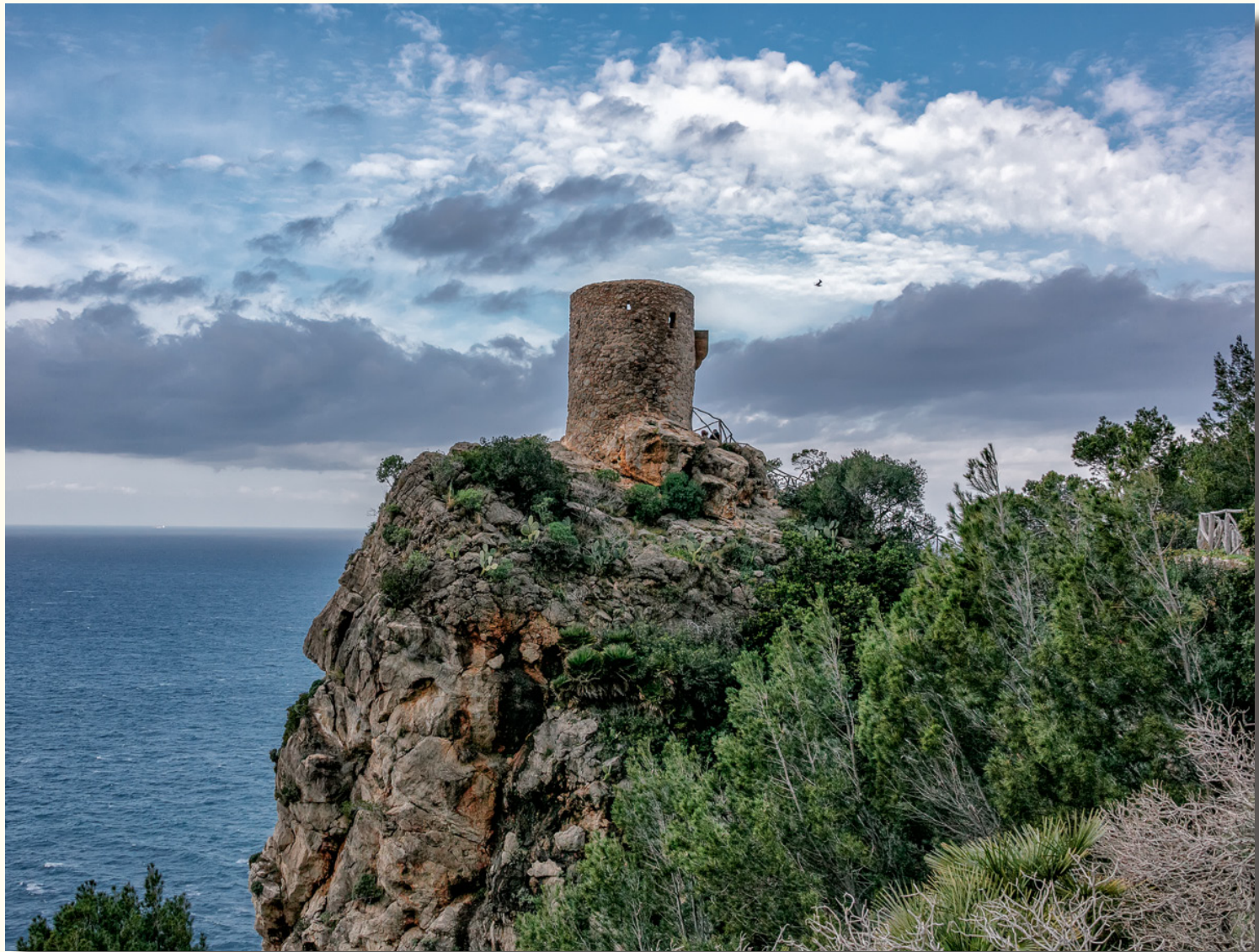
This one is Torre des Verger, an old watchtower from 1579 used by sentinels to warn of Moorish pirates.